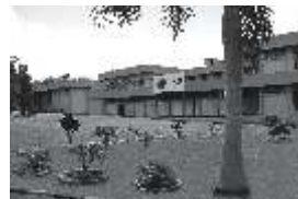
Wipro Seating Manufacturing Facility Wipro Limited, 120\1 Vellancherry Village, Guduvancherry, Chennai 603202.

* The Business and Institutional Furniture Manufacturer's Association