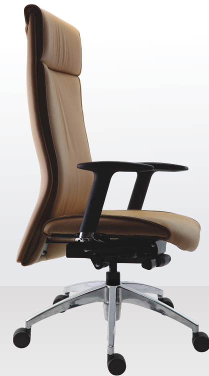
seen above is DEH501613 high back chair with synchro 4 mechanism, 3D armrest and designer aluminium base