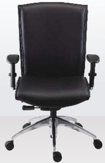
seen above is DEM501613 medium back chair with synchro 4 mechanism, 3D armrest and designer aluminium base