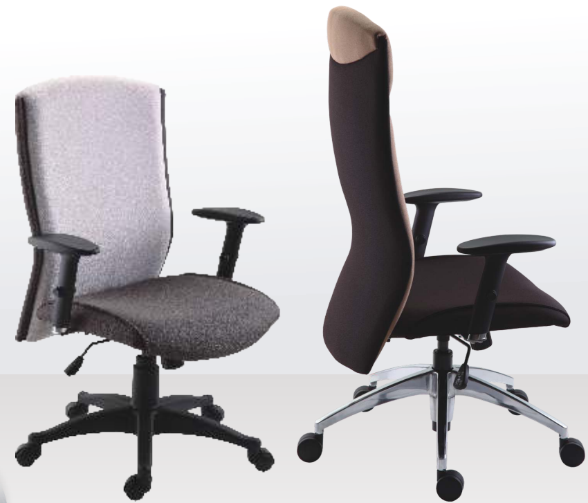
seen above is DEM401711 medium back chair with synchro 1 mechanism, 2D armrest and nylon base

Treat yourself to an unparalleled seating experience that radiates style and status. Sit on and lean back with your arms comfortably rested on premium adjustable armrests. Our collection of premium fabric upholstery escalates Define to a new level of comfort and aesthetics.