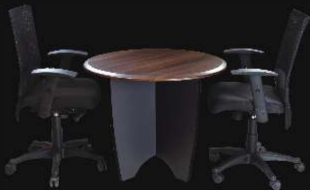
Discussion table with pre laminate understructure

Additional discussion table Size option : 900mm diameter / 1050mm diameter