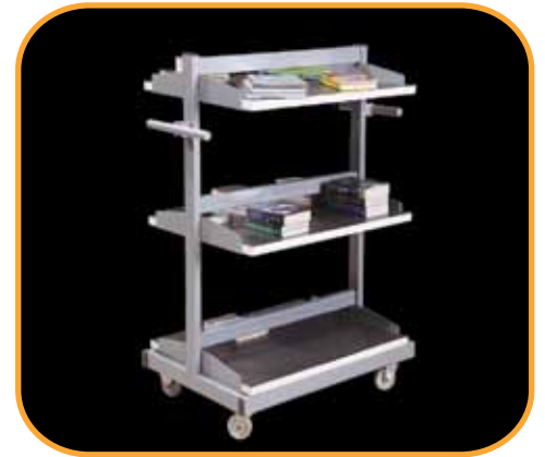
Book Trolley adds to the convenience of library staff for shifting /reshelving books