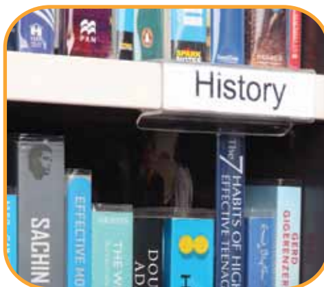
Quick identification of sub categories through easy changeable shelf signage