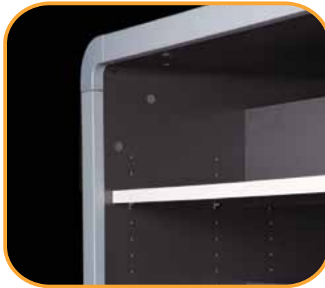
Adjustable shelves to suit varying heights of books. The stark contrasting colour of the frame adds to the contemporary look