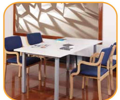
Modular reading table to complement the library