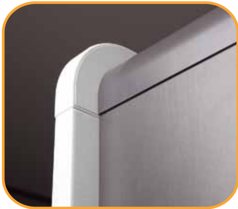
Well finished rounded edges of the end caps and extrusion give a contemporary and modern look to the unit

It is the design detailing and functionality which creates a practical design. The factors such as superior finishing, intricacy and modularity along with overall structural framework, quality of material and in-built strength make search a perfect library storage system.