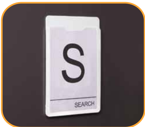
Prominent A5 size side acrylic panel branding for quick category identification