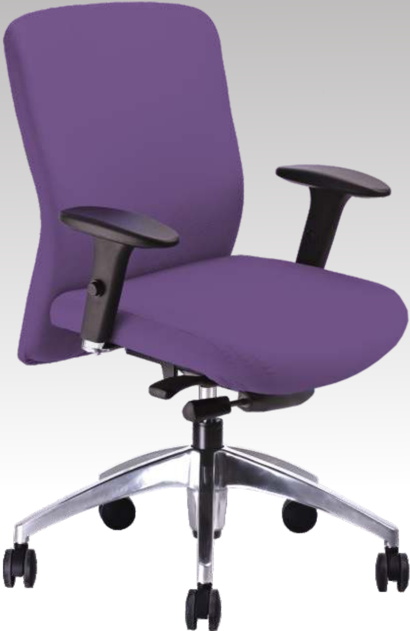
seen above is YSM501711 medium back with synchro 4 mechanism 2D adjustable armrest and nylon base

yuvā ™ smart has reinvented the norms for better and healthier seating. A unique combination of ergonomically contoured backrest with synchro mechanism along with high resilience seat foam and host of armrest options, yuvā ™ smart provides optimal support for your back and encourages healthy seating.