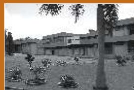
Wipro Seating Manufacturing Facility Wipro Limited, 120\1 Vellancherry Village, Guduvancherry, Chennai 603202.

* The Business and Institutional Furniture Manufacturer's Association