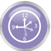
supports longer seating hours