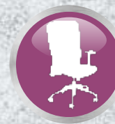
smart high back