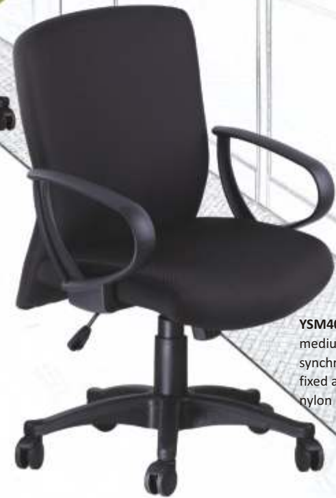
YSM401111 medium back with synchro 1 mechanism, fixed armrest and nylon base