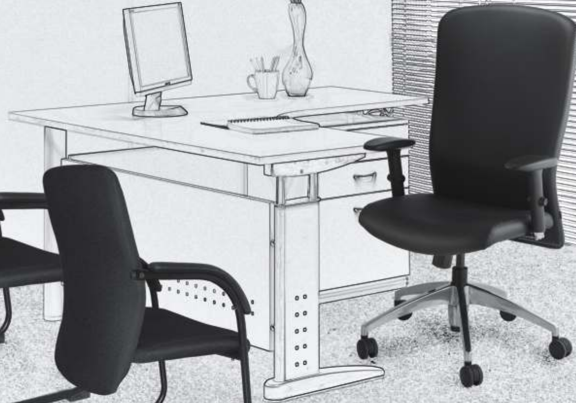
seen above is YSH511313 high back synchro 4 mechanism, height adjustable armrest with black finish and designer aluminium base