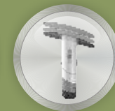
height adjustable arms in silver finish