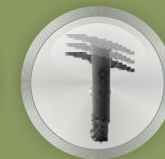
height adjustable arms in black finish