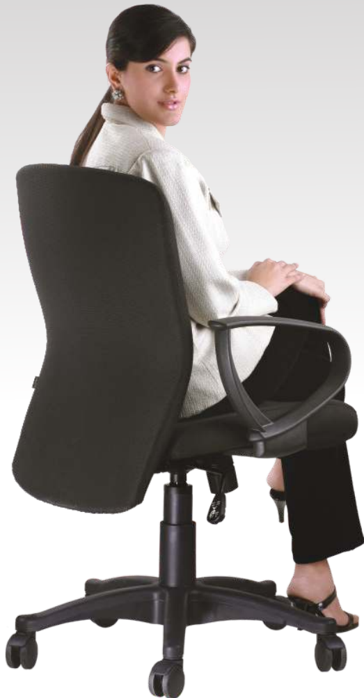
seen above is YSM401111 medium back with synchro 1 mechanism, fixed armrest and nylon base