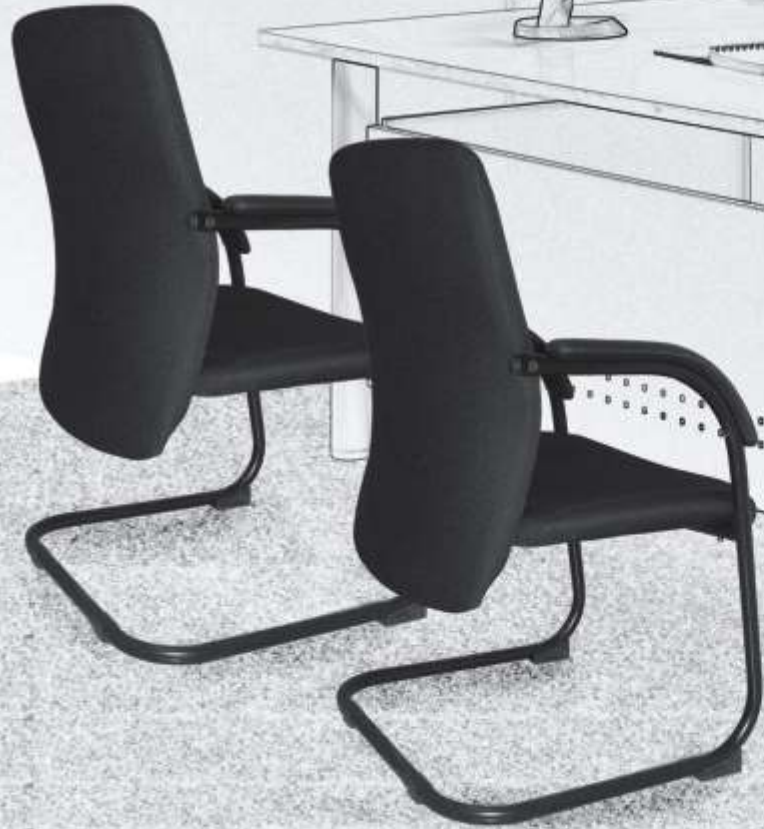
seen above is YSF visitor chair

Wipro Seating brings to you YLVÄ ® smart , a chair designed for you ...to work better and healthier. Suited for varied requirements of a modern office like- executive cabins, workstations, conference, meeting rooms and informal seating areas. YLVÄ ® smart is available in High Back, Medium Back and Visitor Chair options.