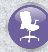
smart mid back