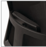
Lumber support that adapts to your back