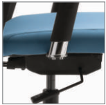
Automatic weight sensing mechanism for comfortable and effortless seating