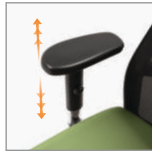
2D armrest with vertical and horizontal adjustment for personalised and unrestricted elbow and arm movement