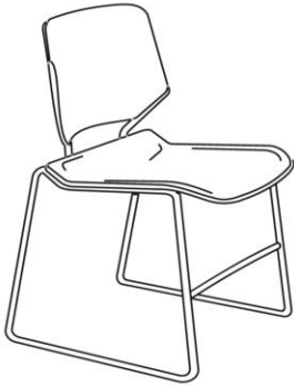
Tango with tablet W 457 x D 533 x H 813