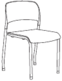
Salsa with glides W 519 x D 513 x H 806