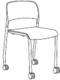
Salsa with castors W 540 x D 536 x H 823