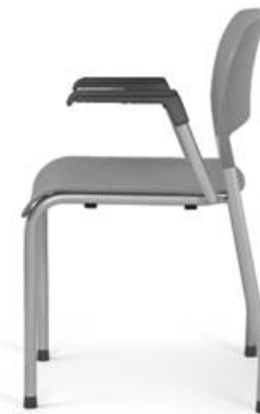
Salsa with arms and glides