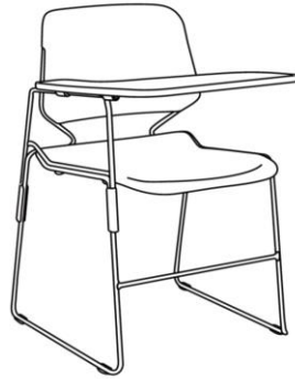
Tango with tablet W 457 x D 590 x H 813