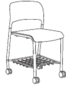
Salsa with wire basket & castors W 540 x D 536 x H 823