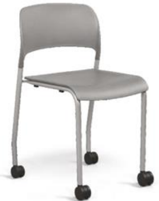
Salsa with castors