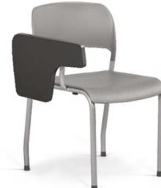
Salsa with tablet