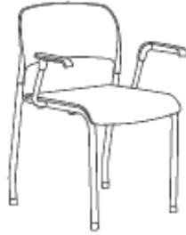
Salsa with arms and glides W 690 x D 513 x H 806