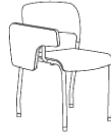
Salsa with tablet W 580 x D 750 x H 823