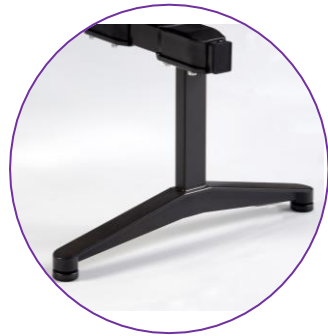
Solid beam leg

Waltz tandem seating is easy to install, facilitates cleaning and withstands rigorous use.